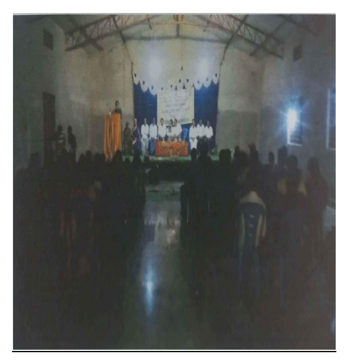
Special Lecture organised on <u>Life skills and education</u> on 18/03/2019 at Valagera halli village, Ankapura Gramapanchayat, Hassan